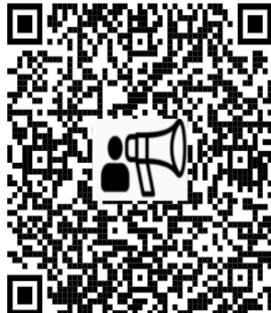
Modern Studies and Politics Progression Pathway