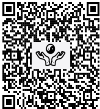
RMPS Progression Pathway

Please scan the QR codes below to find out more about the Modern Studies, RMPS and Politics courses available to young people at Firrhill!