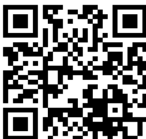
Work Skills Gained from Modern Languages