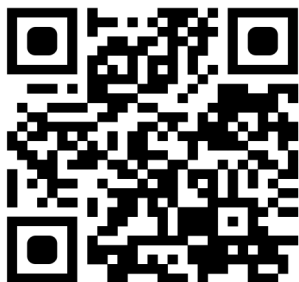
Modern Languages Career Opportunities

Please scan the QR codes below to find out more about the opportunities available to young people!