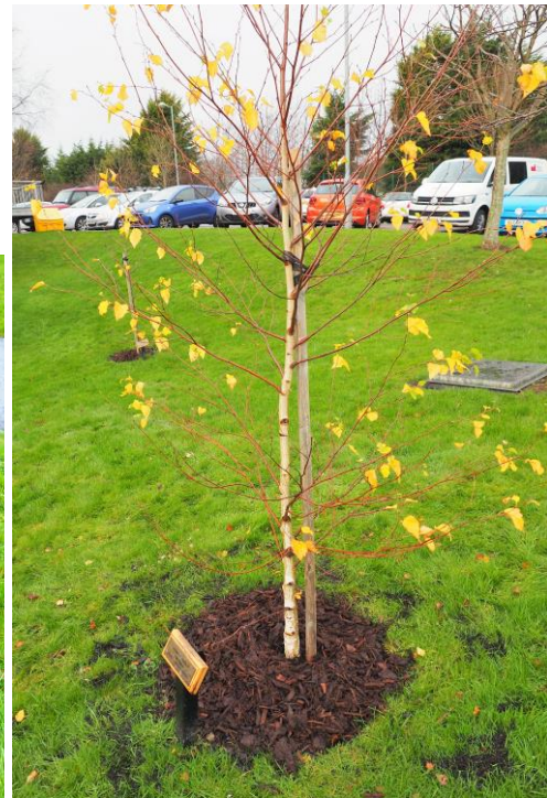
The plaque beneath Zigi's Silver Birch tree is inscribed with the words, "Do not hate. Hate will ruin your life".