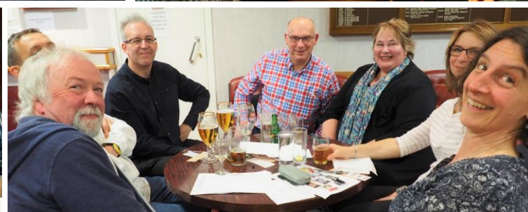
Thanks to everyone who came along on the night and helped to make the PTA quiz night a great success.