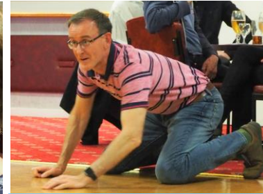
Thanks to the PTA who organised this fun event.